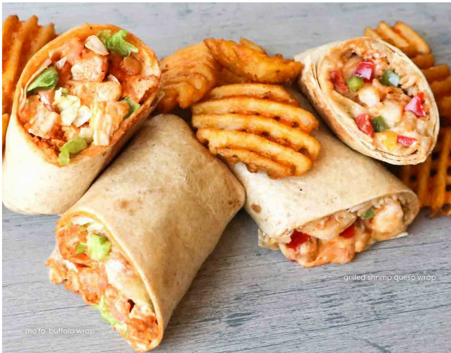
mo'fo' buffalo wrap

(gs) denotes item that can be made with gluten sensitive ingredients.