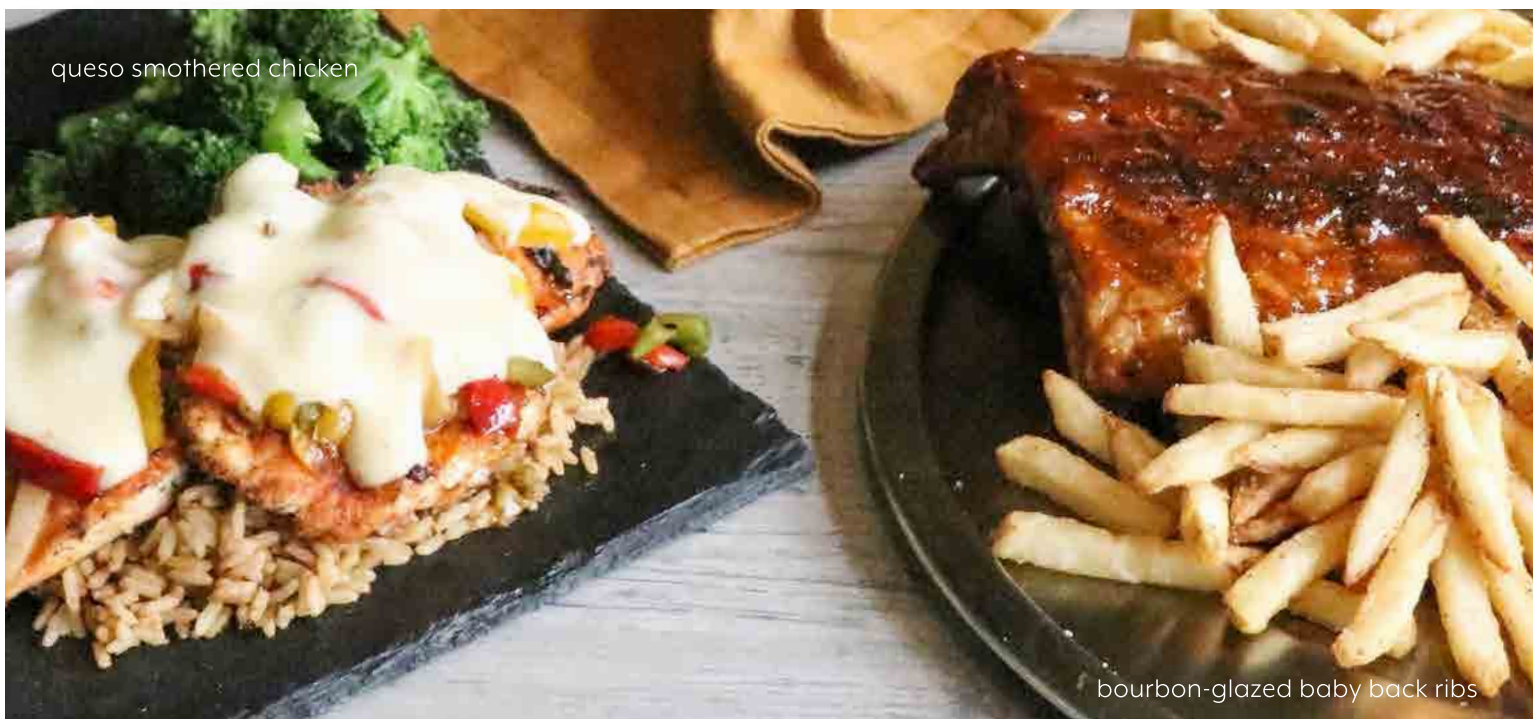
queso smothered chicken