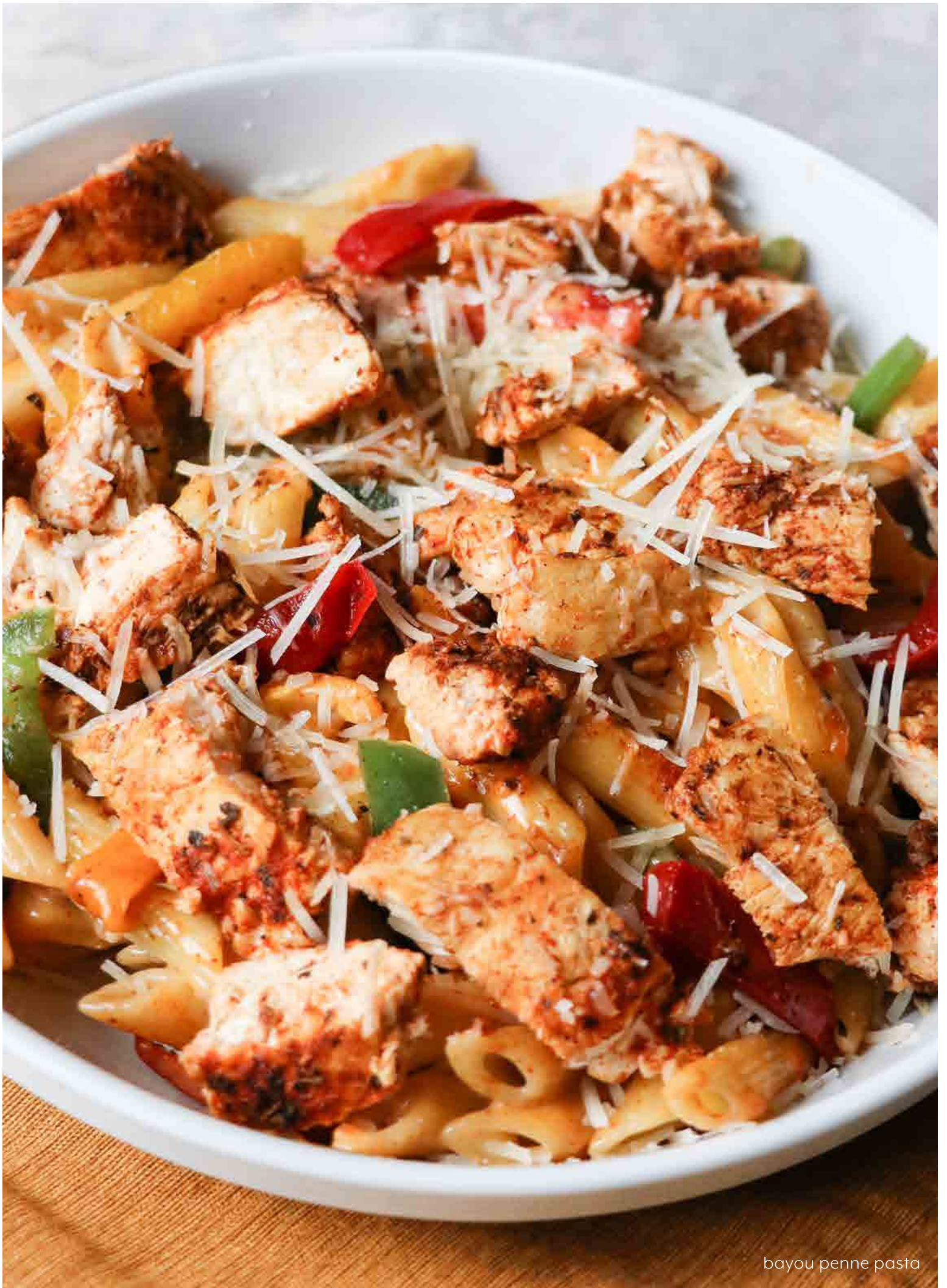
bayou penne pasta