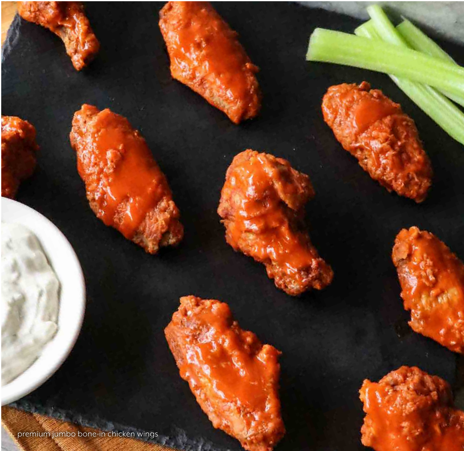
premium jumbo bone-in chicken wings

*all of our wings are spun in scotty's brewhouse™ signature wing sauces and are served with ranch or chunky bleu cheese dressing and celery sticks