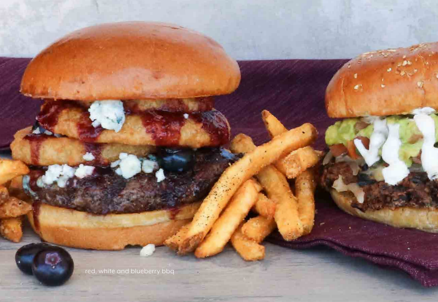
red, white and blueberry bbq