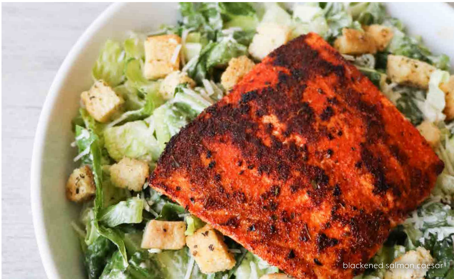
blackened salmon caesar