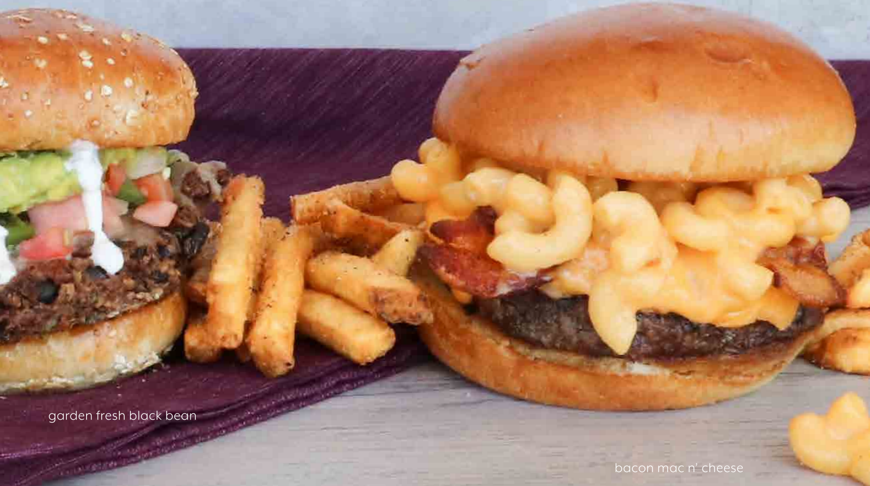
garden fresh black bean